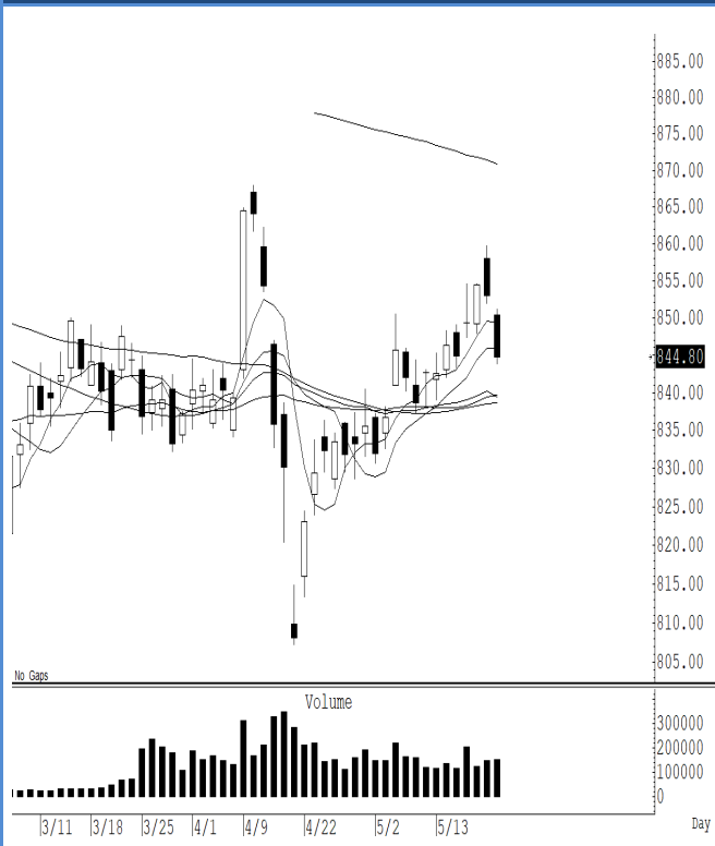
S50M24 (Close 844.80 Chg -8.20)